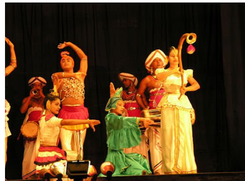
Cultural Show - Kandy